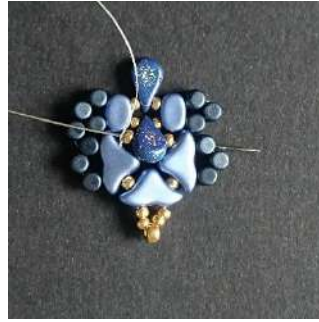
23) Pass in the R11, the Amos, the R11, the Helios, the Minos