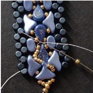
56) Place 1 R11 in the next R11