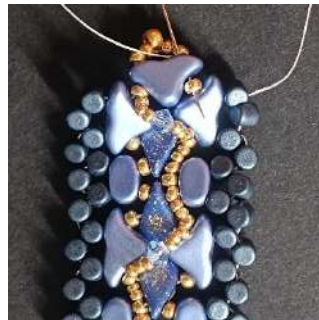
62) Pass in the R11 the Hélios