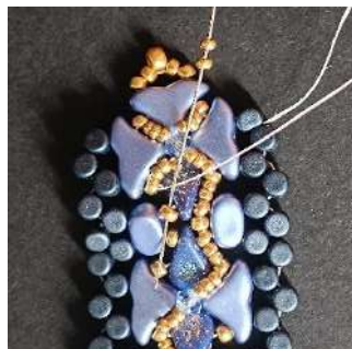
65) Place 2 R15s in R11, like this