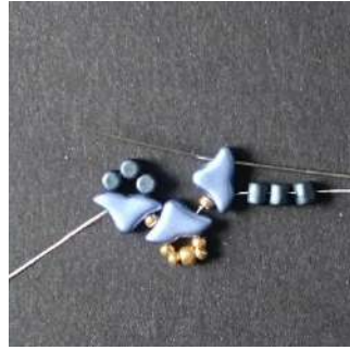
6) Pass through the 2 nd hole of the Helios