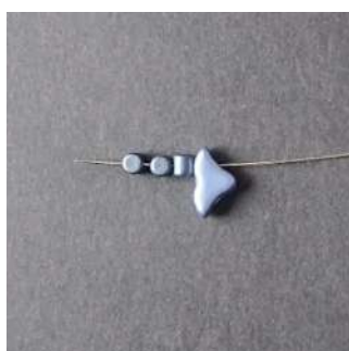
1) Place 1 Hélios and 3 Minos, like this