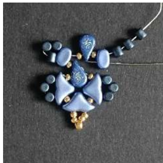
19) Pass through the 2 nd hole of the Lipsi