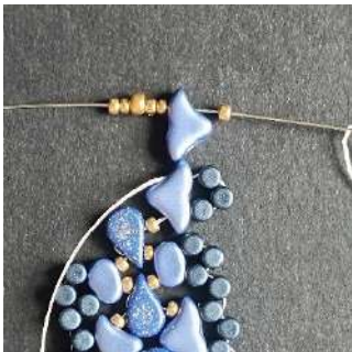
45) Place 1 R11, 1 Helios, 2 R11, 1 R8 (or 1 Pilos), 2 R11