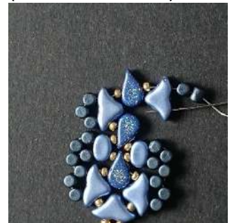
32) Pass through the second hole of the Helios