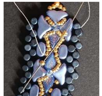
67) Place 2 R15s in the next R11, like this