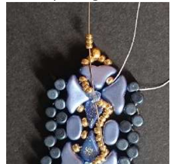
63) Place 3 R15 in P3