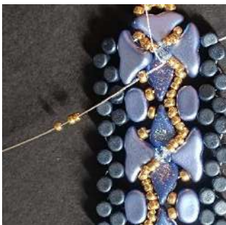
64) Place 3 R15s in R11, like this