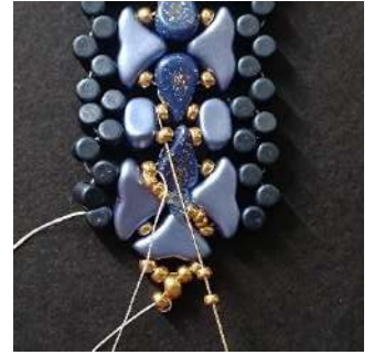
55) Place 2 R15 in the next R11