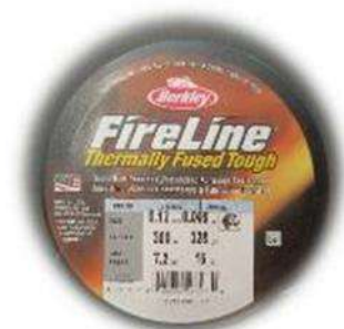
0.12 mm Fireline thread