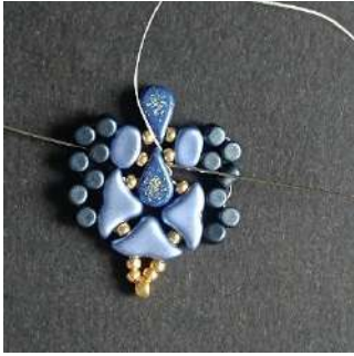
25) Pass in the Amos, the R11, the Lipsi, the Minos