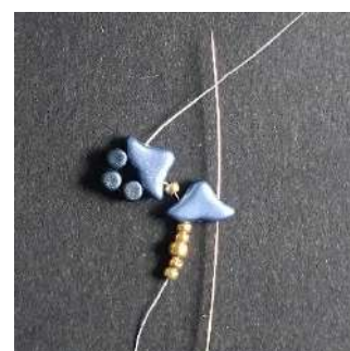
4) Pass through the 2 nd hole of the Hélios