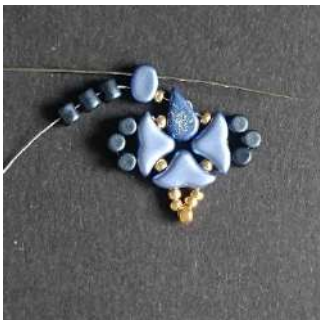
17) Pass through the 2 nd hole of the Lipsi