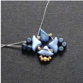
9) Pass in the 2 Minos, the Helios, the R11