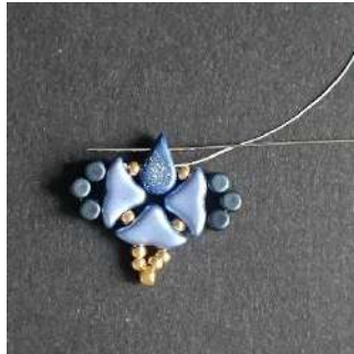
15) Pass in the Amos (hole at the tip)