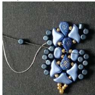
35) Place 1 Minos into the previous Minos and pass in the Lipsi and the R11