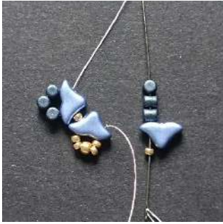
5) Place 1 R11, 1 Helios, 3 Minos