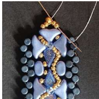
61) Pass in the Hélios, the 5 Seed beads