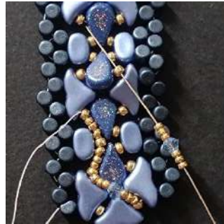
58) Place 3 R15, 1 T3 and 3 R15 in the R11, HERE