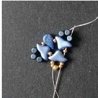
11) Pass in the 2 R11, the Helios, the R11, the Minos