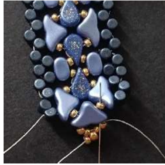
53) Pass in the 2 R11, the Hélios and the R11