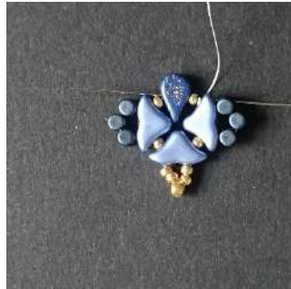
14) Tie a double knot, cut the end of the thread. Pass in the R11 and the Amos