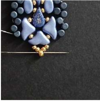
52) Place a stopper-bead in the middle of a new thread and pass it through the R8