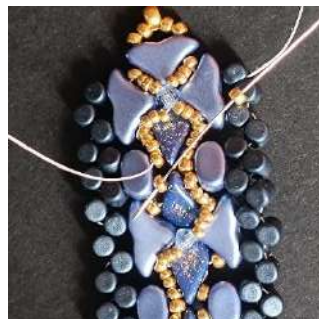
66) Place 1 R11 in the next R11