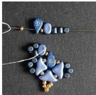
18) Place 1 R11, 1 Amos (hole on the tip side), 1 R11, 1 Lipsi, 3 Minos