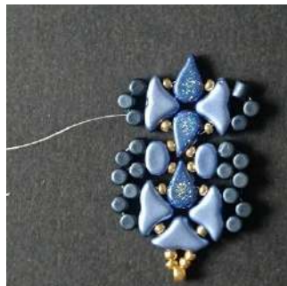
34) You get this