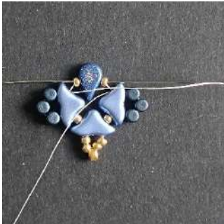
13) Pass in the R11, the Amos and the R11