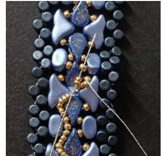
59) Repeat steps 54 to 57, once on one side, once on the other, all the way along