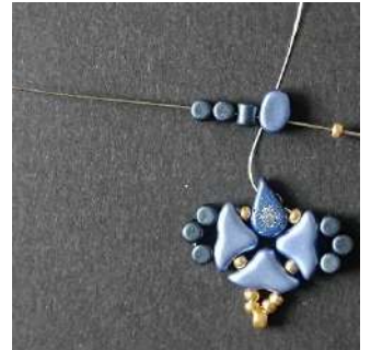
16) Place 1 R11, 1 Lipsi, 3 Minos