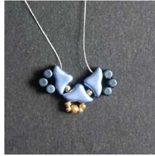
7) You get this