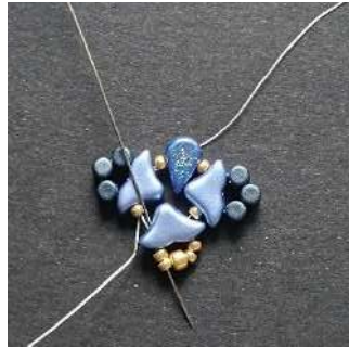
10) Pass in the Helios and the 2 R11, like this