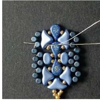
38) Pass in the Helios, the Minos