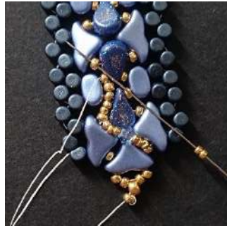
57) Place 2 R15 in the next R11