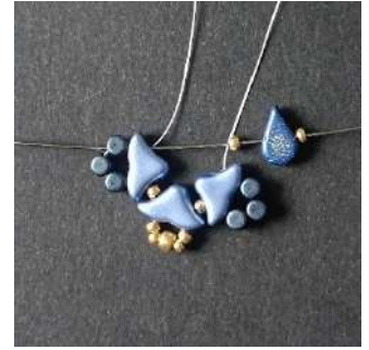
8) Place 1 R11, 1 Amos (round-sided hole), 1 R11 in the Helios, and the Minos, like this