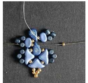
20) Place 1 R11 in the previous Amos (hole on the tip side), and Pass in the R11, the Lipsi and the Minos