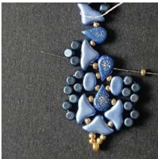
33) Place 1 R11 in the Amos and pass in the R11, the Helios and the Minos