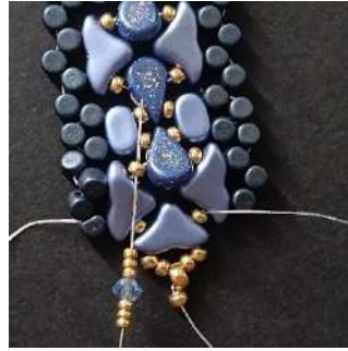
54) Place 3 R15, 1 T3, 3 R15 into R11, HERE