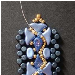
60) You are HERE