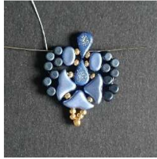
27) Pass in the Minos, the Lipsi, the R11, the Amos