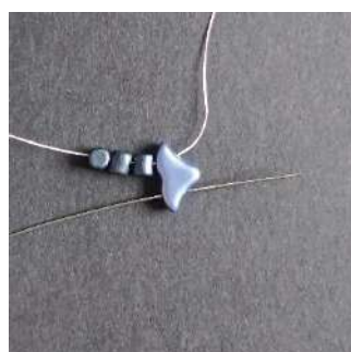
2) Pass through the 2 nd hole of the Hélios