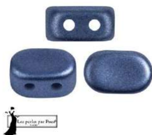
16 Lipsi® Par Puca®-Paris