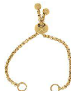
1 clasp of your choice