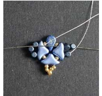
12) Pass in the 2 Minos, the Helios