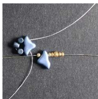
3) Place 1 R11, 1 Hélios, 2 R11, 1 R8 (or 1 Pilos), 2 R11